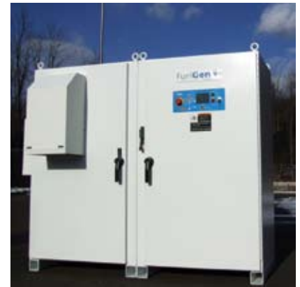
FuelGen Hydrogen Fueling System